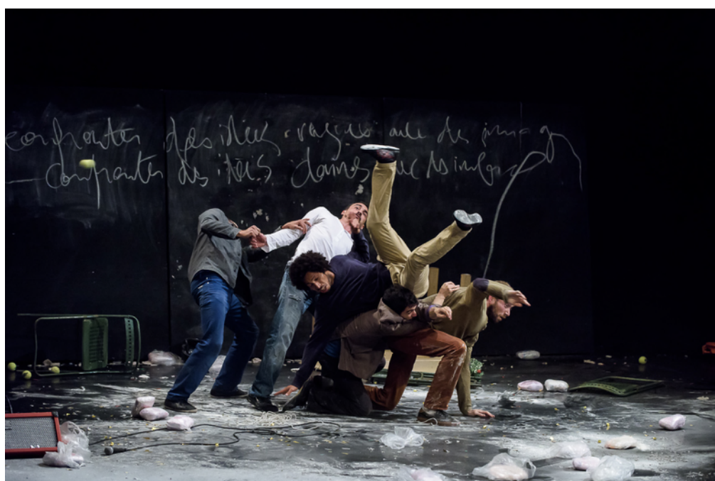
Galktic Ensemble